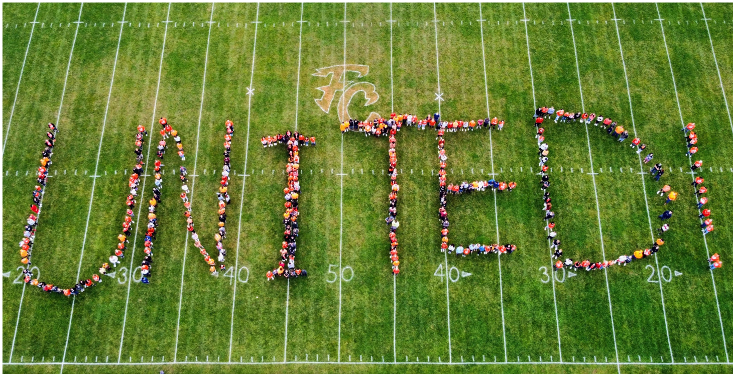
“ Alone we can do so little; together we can do so much”.-Helen Keller

At the FORT, we stand together... UNITED.