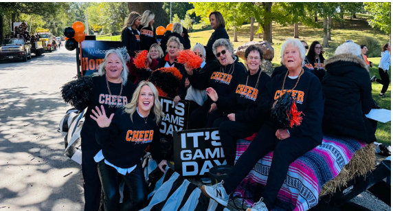
Alumni Cheerleaders got in the spirit of Homecoming!