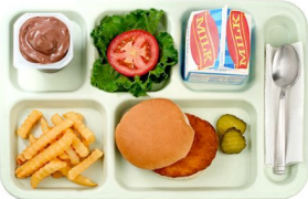
School meals make a difference every day for our kids